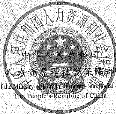
Seal of the Ministry of Human Resources and Social Security, The People's Republic of China

According to the Labour Law of the People's Republic of China and the national occupational skill standards, the certificate is herewith issued after passing testing and assessment.